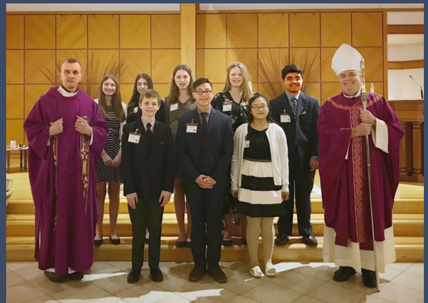
(Pictured left to right)

Congratulations to all our young disciples who received the Sacrament of Confirmation last weekend. May the Holy Spirit continue to guide you, strengthen you, and draw you closer to Jesus.