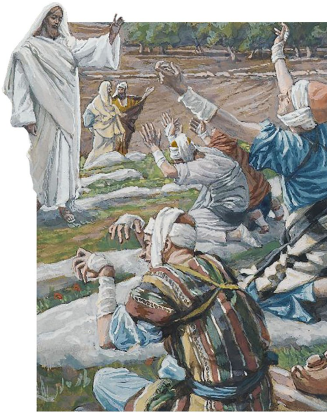
YOUR FAITH HAS SAVED YOU