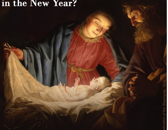
Art: Gerard van Honthorst, Adoration of the Shepherds, 1622