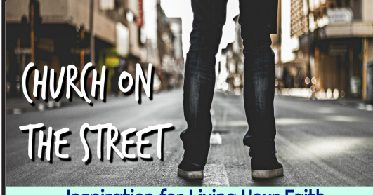
Inspiration for Living Your Faith

The Catechism of the Catholic Church was recently updated as regards Catholic doctrine on the use of the death penalty. The Catechism previously stated "...the cases in which the execution of the offender is an absolute necessity 'are very rare, if not practically nonexistent."