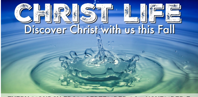
EVERY MONDAY FROM SEPTEMBER 24 - NOVEMBER 5

I am grateful for your dedication to ministry, especially during the summer months when people are away so often. We can clearly see the hands and feet of Jesus in action. The light of your commitment to God and this community shines brightly!