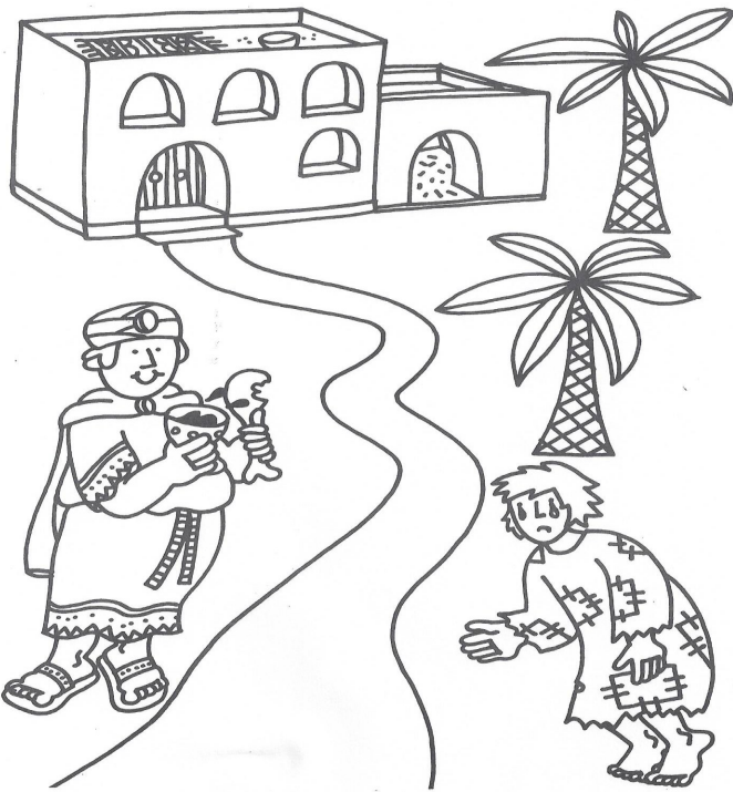
Copy and cut out the two figures, the house, path, and some palm trees. After coloring these separately, stick them onto a large sheet of paper and encourage children to fill in the background.