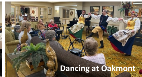
Dancing at Oakmont