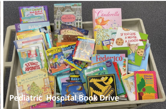
Pediatric Hospital Book Drive